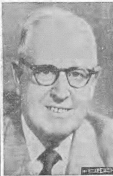
REP. GEORGE P. MILLER

Eastbay members of the Operating Engineers are strongly urged to be sure to vote for Congressman George P. Miller to represent the new 8th district which covers Alameda city and Oakland east of Park Blvd. as well as Hayward, Pleasanton and Livermore.