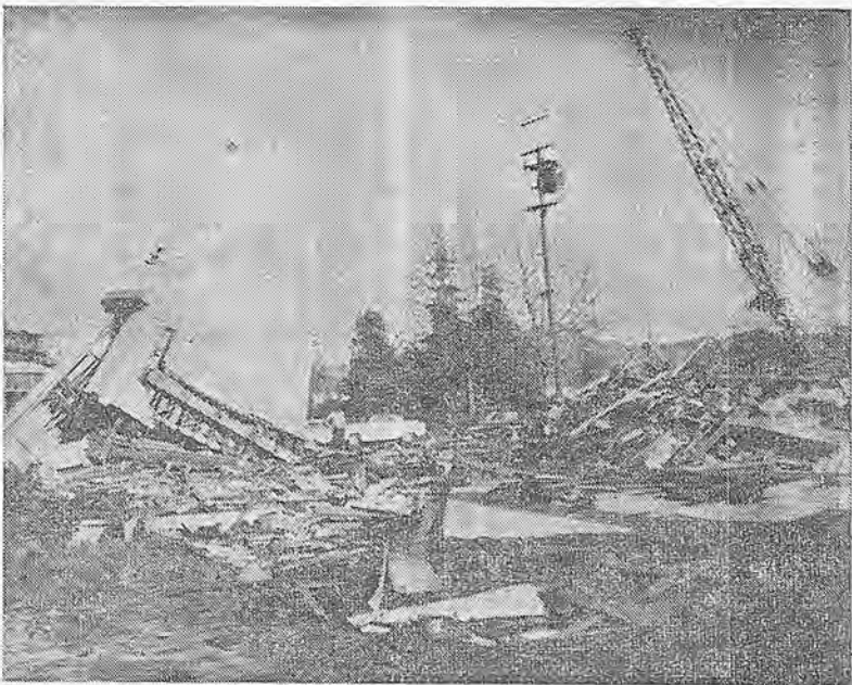
THE COCA-COLA Bottling Co. will no longer be in the way of Highway 12 in Santa Rosa when Lafayette Crane completes demolition.