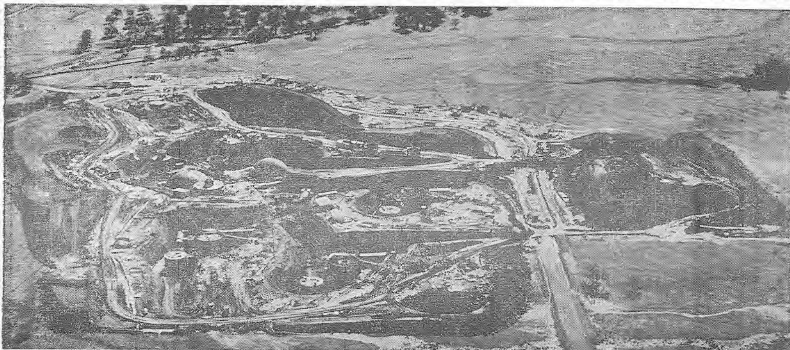
AERIAL VIEW OF TITAN MISSILE SITE at Chico, Calif. This is one of three Intercontinental Ballistic Missile launching complexes now in process of construction in the Marysville area. Deep

excavations and intricate and unusual construction methods feature most advanced defensive installations and are described in detail in the Marysville report.