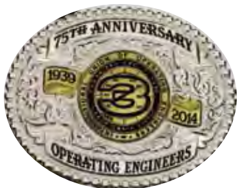
1. Oval Sterling with Gold plating $150