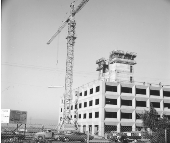
Hint: San Jose, 1971.

Do you recognize this area? Can you remember the job? Your Engineers News staff has spent the last six or seven months knee-deep in Local 3's history, uncovering some never-before-seen photographs and some that were printed more than six decades ago! The photo printed above was tucked away in a "District 90" folder and shows our members with Webcor Co. hard at work on the airport office center on North First Street. (Did you guess that correctly?)