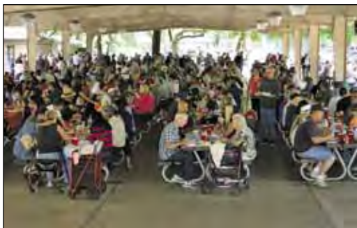
Some of the 900 people who attended this year's Stockton District Picnic eat, drink and visit under the shade structure at Micke Grove Park on May 4.

As you are working on these jobs, if you see something that does not look right, please call the Hall or an agent, and we will be there as soon as we can to check it out. Stay safe, and we will see you at the next District Meeting on Aug. 12 at 7 p.m. at the Hall.