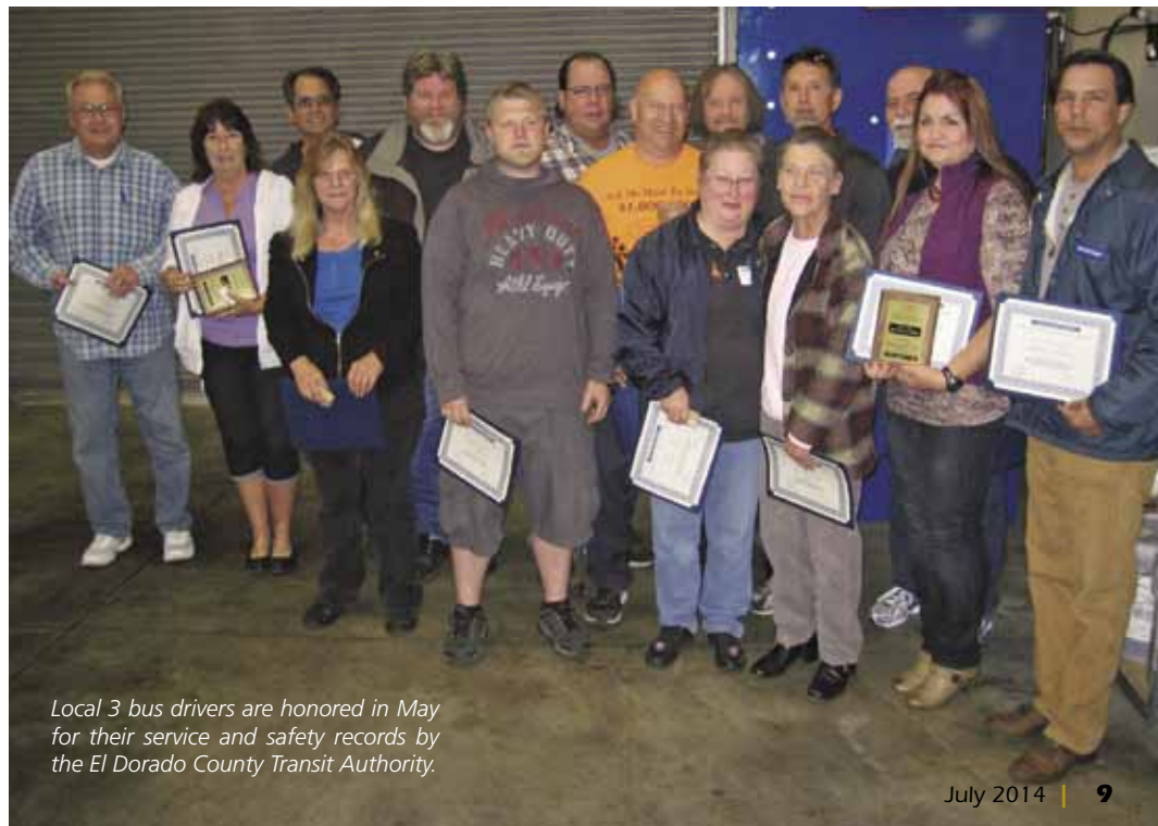
Local 3 bus drivers are honored in May for their service and safety records by the El Dorado County Transit Authority.

job title, agency/employer name, worksite location (name and address), cell-phone number and home-phone number. This information will only be used by me to keep you informed on what's happening with your unit or if I need to contact you for information or support. If you have a question or concern about something happening at work, drop me an e-mail and bring it to my attention ASAP. (Often there are timelines we must adhere to in order to resolve issues.) Thanks for your continued support and efforts!