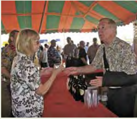
Members and their guests partake in the complimentary wine and beer during the picnic.