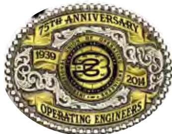
2. Oval Bronze with Silver & Gold plating $100