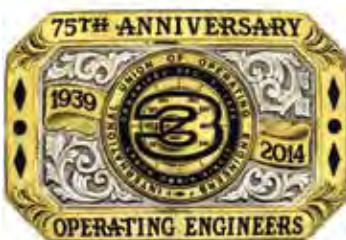
4. Rectangle Bronze with Silver & Gold plating $100

Questions? Call the Anniversary Hotline at (510) 748-8349 or e-mail 75years@oe3.org. (Images can also be viewed online.)