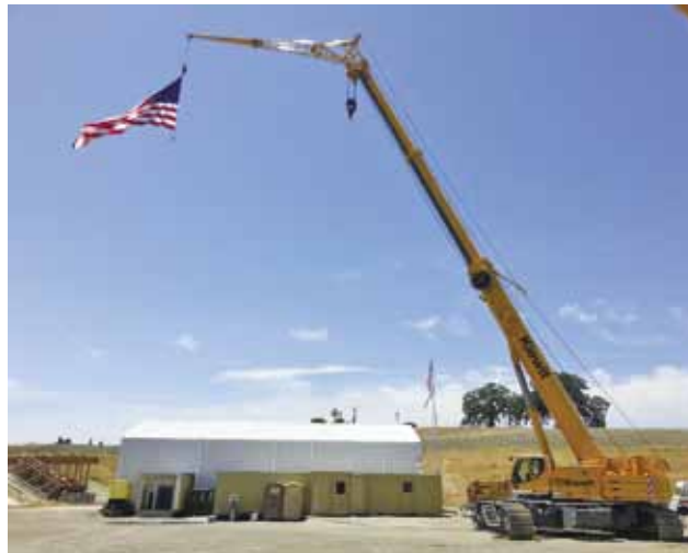
Kiewit's new LTR 1220 is the first hydraulic crawler crane of its size in Northern California.

Kiewit is also busy, using its new LTR 1220 – the first hydraulic crawler crane of its size in Northern California.