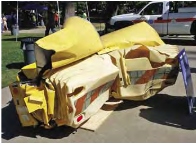
Truck Mounted Attenuators (TMAs) like this one, which has obviously been hit, are used to help protect workers along the highways.