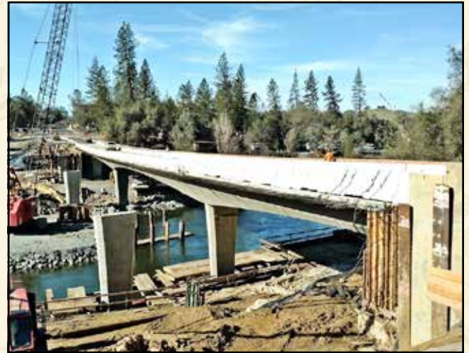
Operators working for MCM Construction continue to work on the South Fork American River Bridge in Coloma.