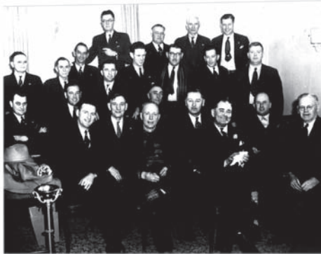
Above: Local 3 officers and staff, 1941.

The 70th anniversary history book is well underway. The book is in production and scheduled for release in the fall of 2009, just in time for the holidays.